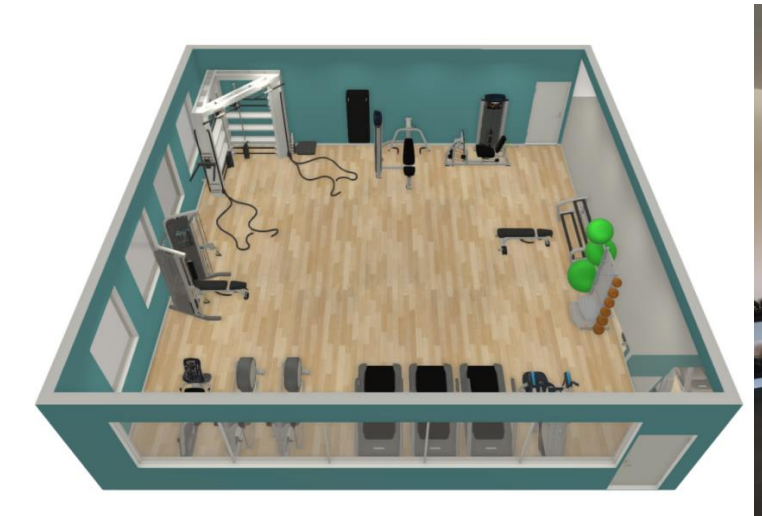
Take a 360° tour of Larkspur's fitness center – from layout, to rendering, to reality!